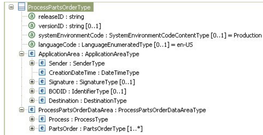
Figure 2.2. Message Hierarchy

The Application Area is standard across the BODs. Every BOD may have a different set of verbs that can be used with it. The verbs describes the various actions that can occur. More detail about these components can be found in the appropriate sections with in this guideline. For a more detailed explanation of the BODs design structure, please refer to the BOD XML Implementation Reference document available from the STAR Web Site.